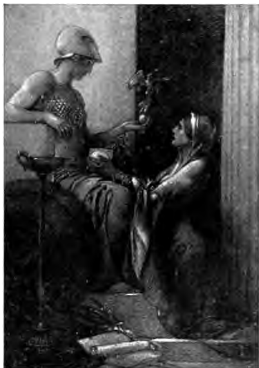
SEATED MAN AND KNEELING WOMAN